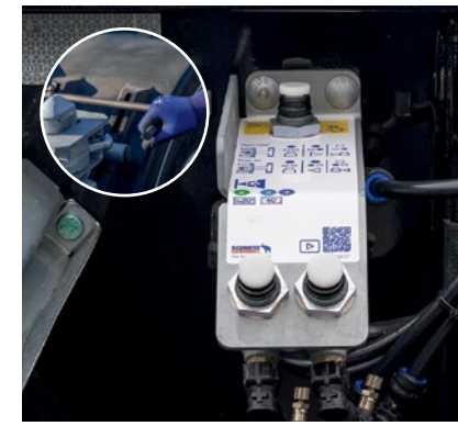
Control unit for pneumatic locking for the rear extension, optionally with manual locking*.