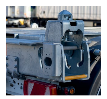
The height-adjustable STEP LOCK® * on the rear extension allows 40' and 45' containers to be picked up without a tunnel in two simple