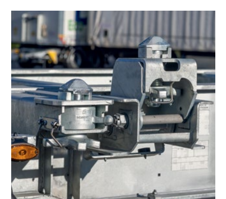
With 2 x 20' loads, the height-adjustable KLAPP LOCK takes over the locking of the front