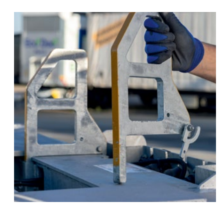
Easily replaceable container guides for containers on the front beam.