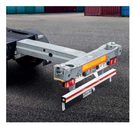
New: Damped rear extension moves pneumatically to the selected locking position and brakes gently.