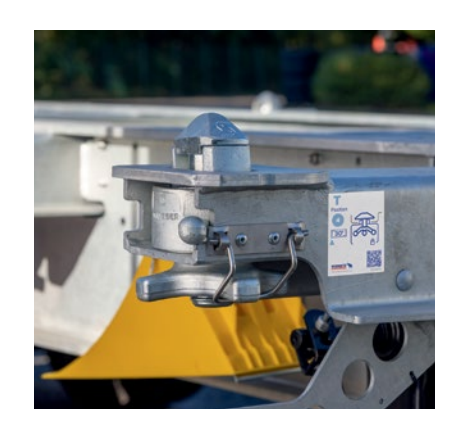
Twist locks with protection against twisting on four pairs of container beams as standard locking.