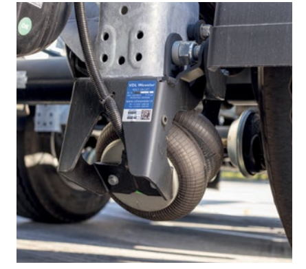
The lift axle* as a starting aid extends the wheelbase and increases the pressure on the drive axle. Unloaded, the lifted position reduces tyre wear.