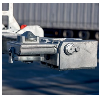
Folding lock on the rigid front bar in the twist lock position.