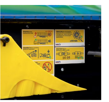
New operating concept with loading plan and clear function and warning notices on locks and extensions.