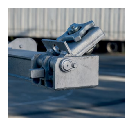
Folding lock as PIN lock for tunnel containers on the front beam.