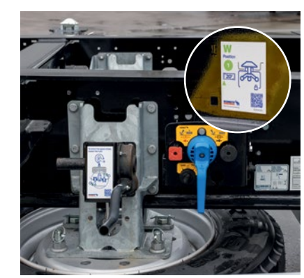
New labelling on locks and extensions for reliable identification of the different loading positions, supported by a loading plan and operating videos via QR code.