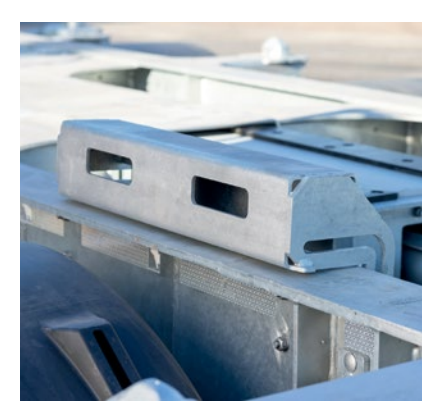
Three pairs of folding container supports* for containers without tunnel.