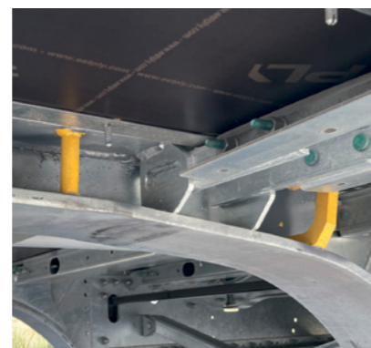
Combined transport: Ferry lashings* on the long girder for short-sea traffic.