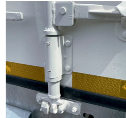
Robust lock system for the rear doors, 2 espagnolette locks per door.