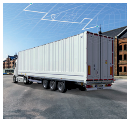
Tour monitoring in real time thanks to TrailerConnect® telematics installed as standard.

ROTOS chassis: 1 million km or 6 years Warranty