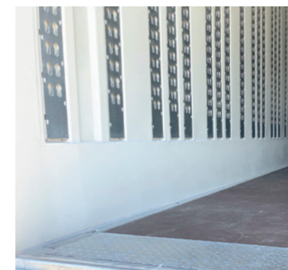
Durable and robust screen-printed floor up to 8,000kg* forklift axle load according to DIN 283. Sealed floor plates prevent moisture from reaching the cargo from below. Recessed wear plate* protects the floor at the rear.