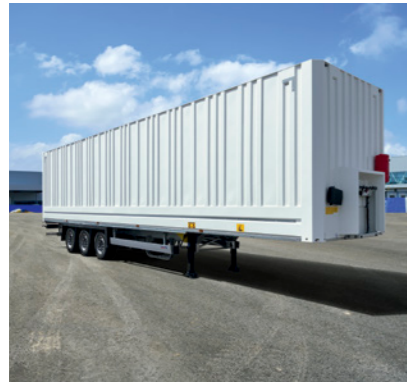
Container Sea body for ferry traffic and to protect the goods against theft. The integrated heavy duty base rub rail, very robust for ferry traffic and against theft.