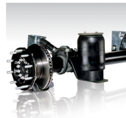
ROTOS axle with reliable braking effect through 430mm discs with intelligent air cooling at the axle head.