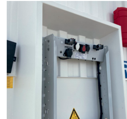
Additional protection for light and brake connection ideal for unaccompanied ferry-traffic.