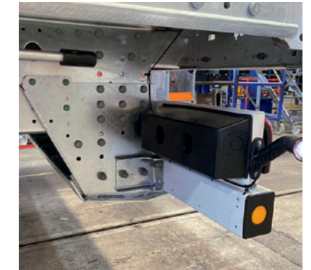
Extra reinforced underride protection skid* for mega tyres in conjunction with ferry-equipment.