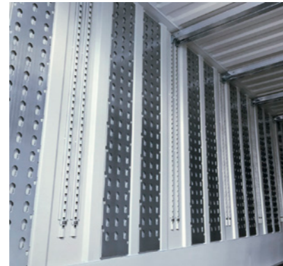
Recessed keyhole plate combined with double-deck system* for horizontal beams, tension straps and clothes rails.