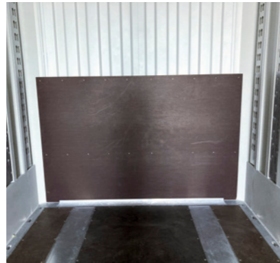
Steel end wall with plywood panel*: Protection for cargo and trailer.