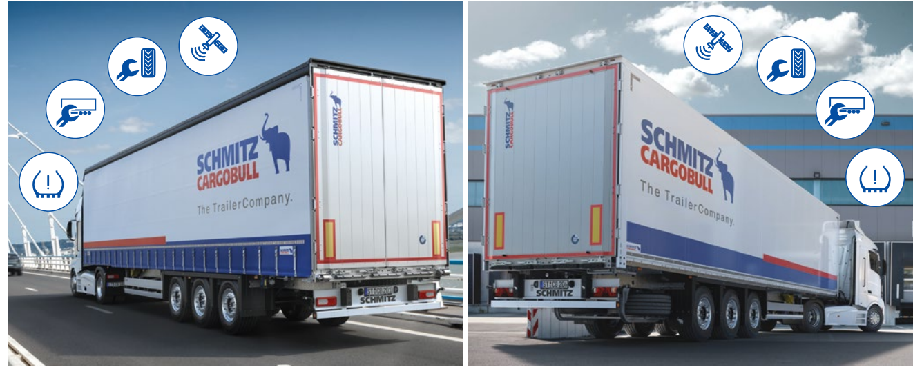
For all Curtainsider S.CS SMART (MEGA, UNIVERSAL, X-LIGHT, PAPER, COIL) and the dry cargo vessels S.KO EXPRESS SMART with CTU telematics control unit.