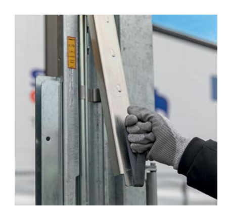
Simple handling via proven trailer technology: The rear height adjustment can be operated within minutes, in a similar way to our VARIOS height adjustable bodies, but without additional