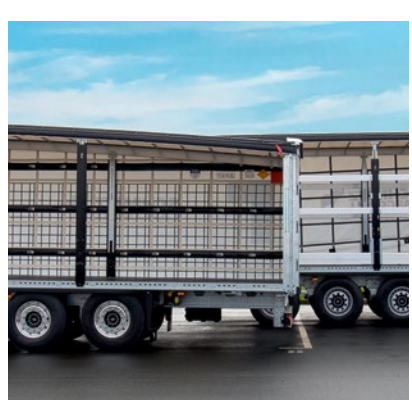
No compromises when loading from the side and rear: the load securing is also compliant with well-known and proven standards.