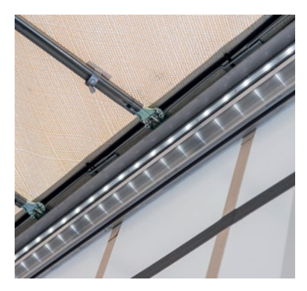
Interior lighting** for more work safety.

TrailerConnect® telematics can also monitor the height adjustment of the aerodynamic curtainsider, i.e. a sensor detects whether the roof is raised or in the ECO position.**