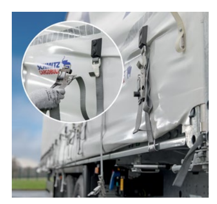
Quick flexible adjustment of the side tarpaulin on EcoFLEX and EcoVARIOS allows for an easy interchange of aerodynamic rear to full load volume