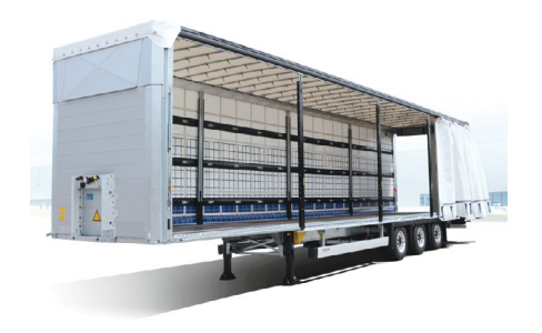
Standard body: The curtainsider's standard curtain is very smooth-running and can be opened and closed quickly and easily with just one hand.

An extra strong chassis for a total weight of 44 tonnes, designed for heavy forklift entrances and flexible load securing systems for more time savings - these are just some of the advantages of the trailer.