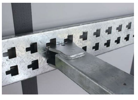
Load securing: A wide range of equipment such as beams, curtains, straps and loops are easy to handle and can be positioned flexibly.