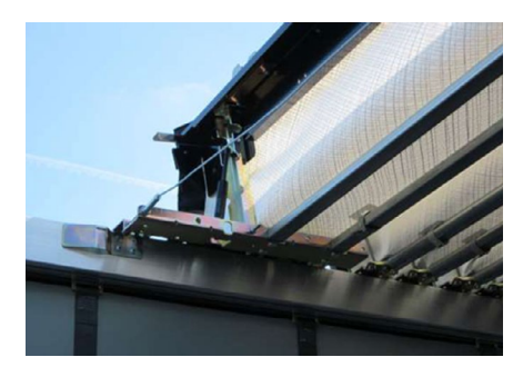
Schmitz Cargobull Safety Roof: Integrated diagonal bracing increases body strength.