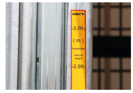
The height-adjustable VARIOS body ensures simpler and more flexible dispatch. The interior height is adjusted in two 50mm steps using plug-in strips.