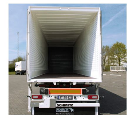
Opened double wing door with an opening angle of 270°. Close-fitting to the side wall for good manoeuvrability.