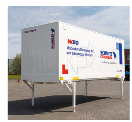
Smooth front and side walls for individual labelling. For freight rail transport, the W.BO interchangeable boxes are equipped with gripping edges.