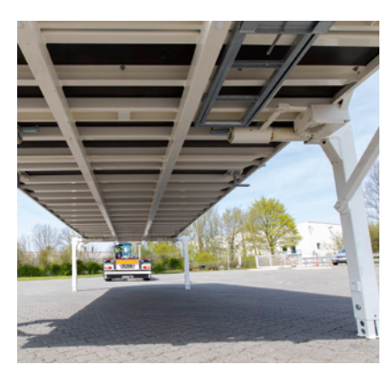
Stable and robust base for high loads and frequent changes.