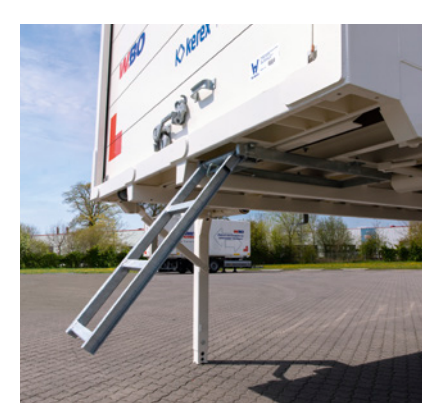
Galvanised steel folding ladder for access to the load compartment.