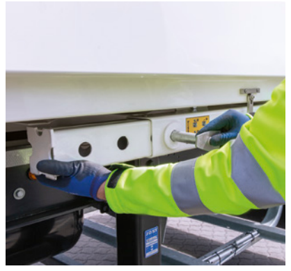
Adjusting the telescopic support leg* for the semi-mounting heights of 1,120 mm, 1,220 mm and 1,320 mm.