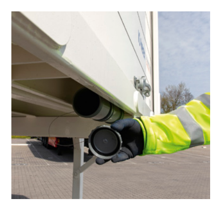
Document tube* for accompanying documents mounted on the underside of the rear.