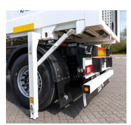
Four support legs with diagonal securing according to DIN EN 284 (as standard version with fixed fifth wheel height of 1,320 mm). Four receptacles for securing with twist locks according to coding profile C30.