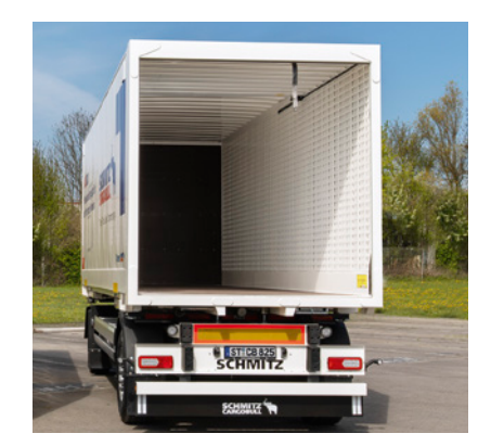
Open roller shutter* in interchangeable case for fast loading cycles, quick access at the ramp and in confined spaces.