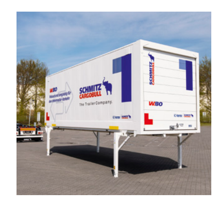
Detached Swap Body W.BO in robust steel construction with rail-compatible roller shutter*. The swap body is ideal for use in CEP transport, encounter and freight transport.