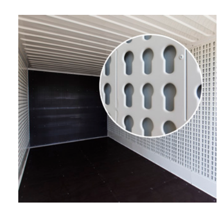
Interior fittings in sheet steel with keyhole plate for locking and clothes rails.