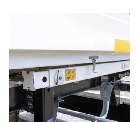
Support leg 90° in transport position with safety catch.