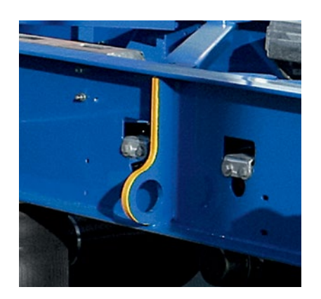
The semi-trailer container chassis can be equipped with ferry lashings* for use in ferry transport.