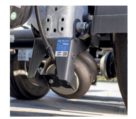
The lift axle* as a starting aid extends the wheelbase and thus increases the pressure on the drive axle. Unloaded and in the lifted position, tyre wear is reduced.