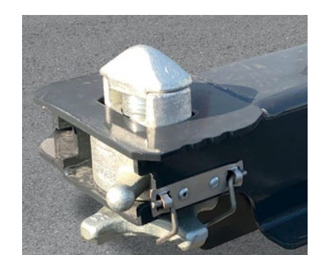
Standard TWIST LOCK locking mechanism: retractable and with anti-rotation lock