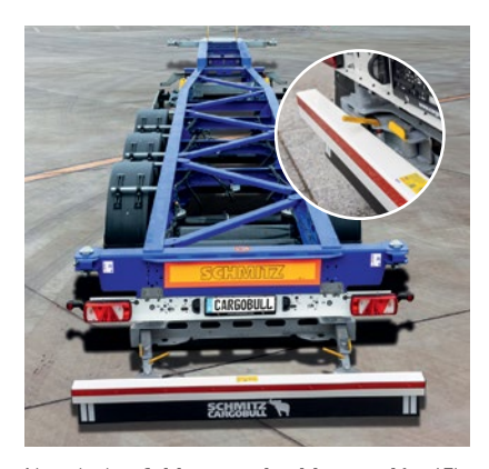
New design: fold-out underride guard for 45' containers is easier and safer to handle without loose parts that can get lost.