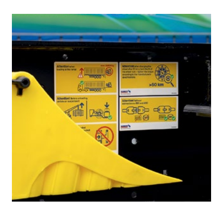
New operating concept with loading plan and clear function and warning notices on locks and extensions.