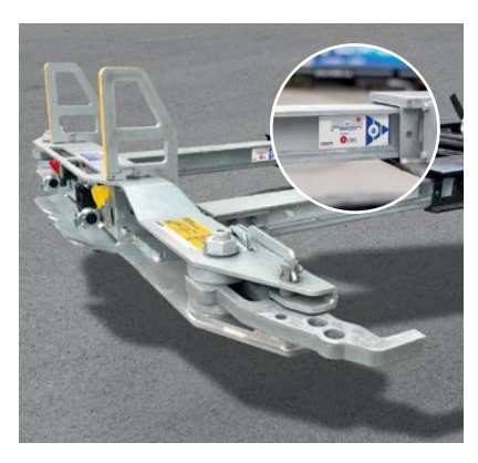
Mechanical front extension for 45' containers is spring-mounted on rollers and easy and safe to handle.