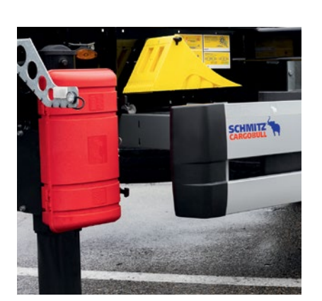
New side collision protection and fire extinguisher * on the support structure.