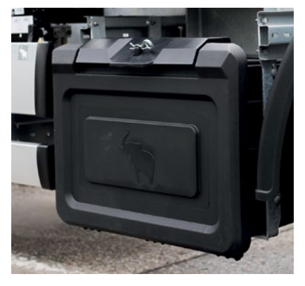
The sturdy tool box* next to the side collision guard stores all the necessary equipment safely and neatly.