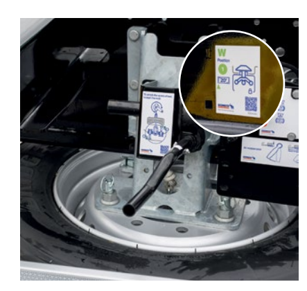
New labelling on locks and extensions for reliable identification of the different loading positions, supported by a loading plan and operating videos via QR code.