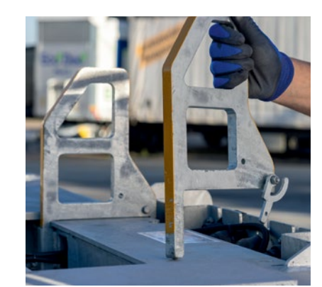
Easily replaceable container guides for containers on the front beam.