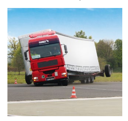
Fully certified body according to DIN EN 12642 code XL including beverages transport. Additional high security of goods due to intergrated anti-theft protection 1.8m high in the curtain.