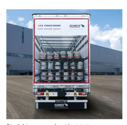
Straight rear panel and flush lock rods make sign writing easy.

Including CTU hardware and basis contract ex works**