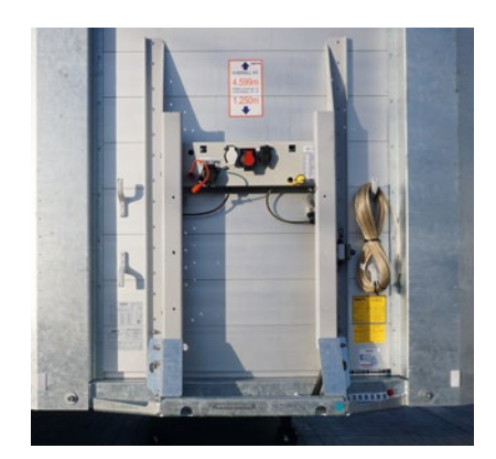
The C-couplings PLUS 2 x 7 +1 x 15-pin sockets fitted at the front of the bulkhead fit all tractor units and have an operator-friendly design, reducing the risk of confusing the connections.