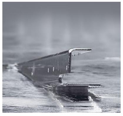
Galvanised MODULOS chassis is easy to maintain with a 10-year warranty against rusting through. All steel parts are individually galvanised, providing excellent corrosion protection.