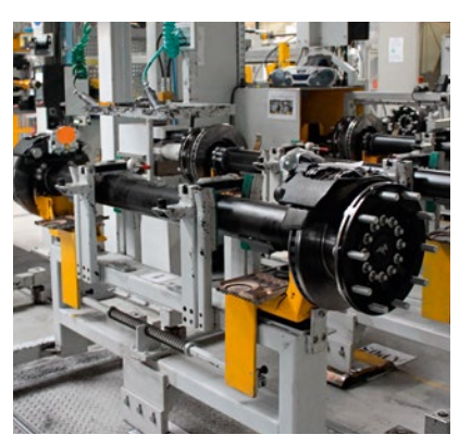
ROTOS axles with disc brakes for high traffic safety and lower total cost of ownership. Six years' warranty on hub and tube, and more than 1 million ROTOS running gear sold to date.