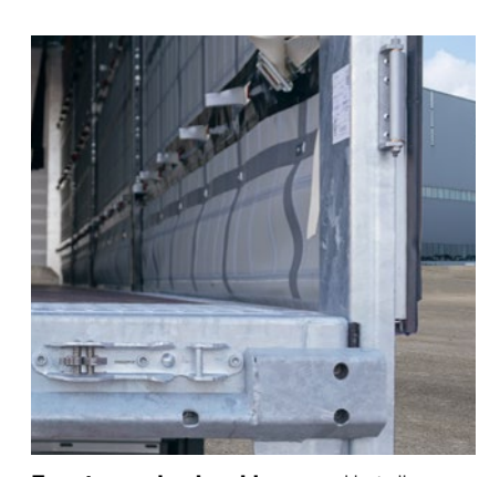
Easy to repairs door hinges and hot-dip galvanised corner supports for durability.