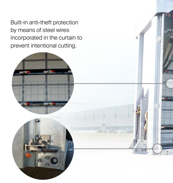
The curtain tensioner and the door catch are easy and safe to operate, increasing your driver's day-to-day safety.

10 years warranty against rusting through for the MODULOS chassis