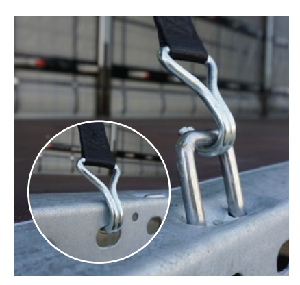
Flexible load securing with fulllength lashing holes in the side rave and optional 15 pairs of 5t lashing rings.