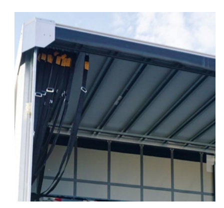
Fixed Schmitz Cargobull aluminium roof load restraint options. Our optional restraint straps with recessed tracks on both sides or in the middle prevent loads from slipping, improving safety.