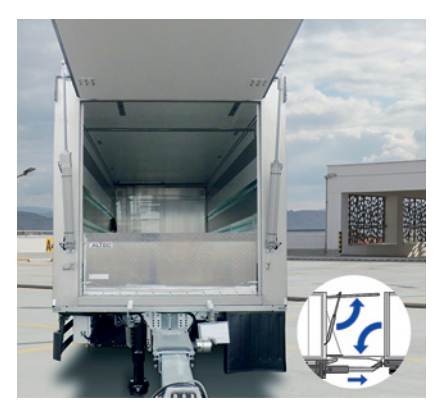
Transition in the through-loading train: End wall flap for trailer Z.KO is folded up as weather protection.folded up and distance adjusted with pneumatically locked, extendable drawbar.*