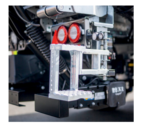
New folding ladder design coupled with SafeStart: when the ladder is folded out, the brake is activated at the same time. With two steps on both sides, it conveniently provides safe access to the vehicle.