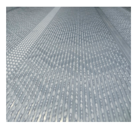
Multifunctional floor with optimized slip resistance, easy load securing when fixing vertical telescopic beams as well as simplification of hygiene through faster cleaning.