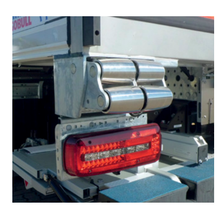
Dynamic Ramp Protection (DRP) and a double rubber strip protect the rear end when approaching the ramp.