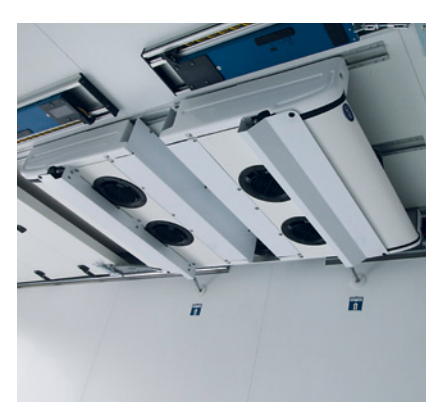
Ceiling-mounted auxiliary evaporator for MultiTemp versions and trailers in through-loading