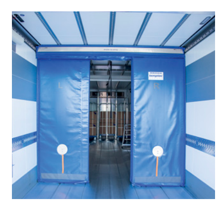
3-piece curtain, adjustable lengthwise and crosswise with magnetic holders on the top.