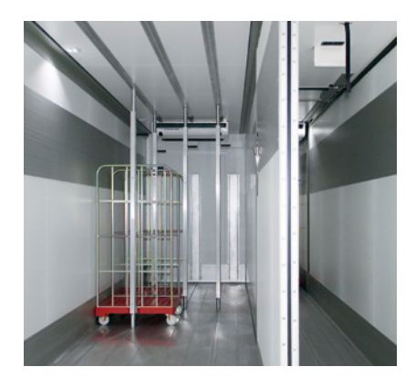
Airline rails in the ceiling and floor simplify load securing with vertical telescopic beams.