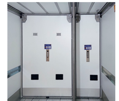
Sliding partition wall made of highly insulating FERROPLAST®: Fast, variable MultiTemp partitioning; optionally available for 1/3 and 2/3 partitioning or as a continuous wall.