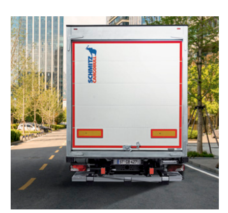
Roller shutter doors