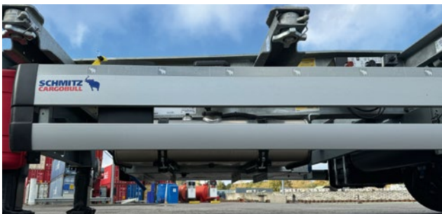
High ground clearance under the Genset of approx. 310 mm.