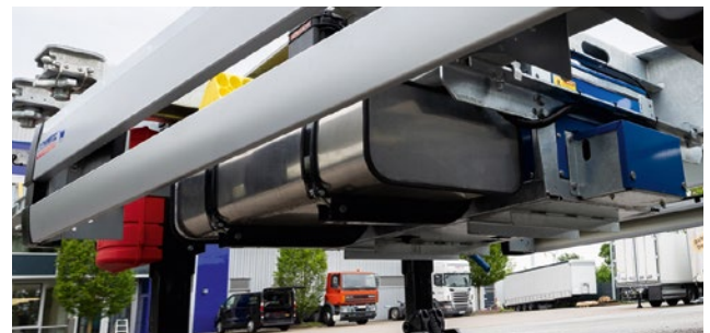
130 litre diesel tank for continuous operation of refrigerated containers for several days.