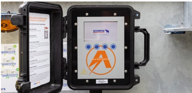
The control panel with TFT monitor shows the operating status, consumption, total running time and the next maintenance date, among other things.