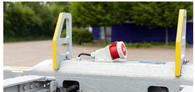
Easy handling: power supply to the refrigerated containers via the CEE socket on the front bar .