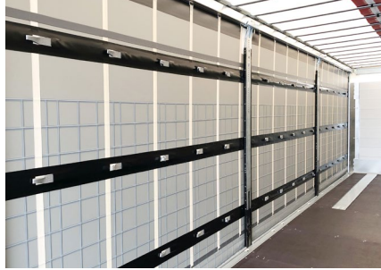
POWER CURTAIN: Structure without top slats for shorter loading and unloading times and greater work safety.