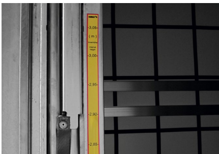
VARIOS superstructure: Height adjustment in 50mm increments on the bulkhead and rear portal from 2,800–3,000mm. Ideal for changing to fifth wheel heights for maximum flexibility in everyday transport.