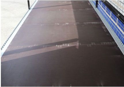
Glued floor combines longer durability and optimised tightness. It is specially designed for high-capacity forklift axle loads of 7.5 tonnes.

With an internal height of 3,000mm, the curtainsider semi-trailer S.CS MEGA enables three box pallets to be stacked on top of each other and offers a total volume of up to 96 pallet cages.