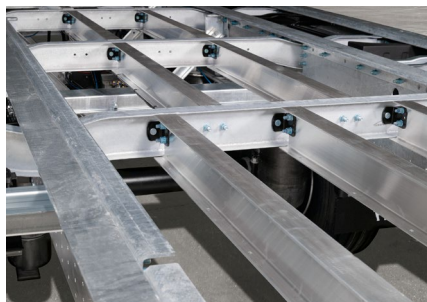
Rolled MODULOS chassis: Corrosion-resistant and easy to repair thanks to bolted and hot-dip galvanised technology.