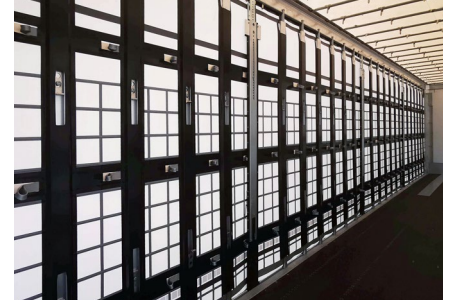
POWER CURTAIN PLUS: Positive-locking loading of tyres and other non-rigid goods without additional aids.