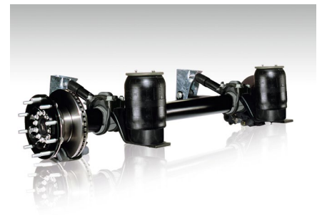
ROTOS axle with reliable braking effect thanks to 370mm discs with intelligent air cooling at the axle head.