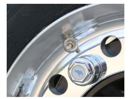
Tyre pressure monitoring system decreases tyre wear, lowers fuel costs and reduces the risk of breakdowns.