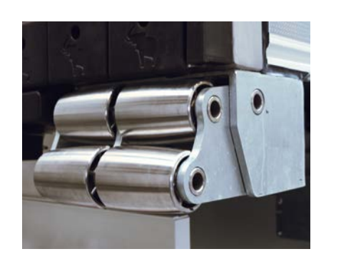
Compression roller bumpers (DRP) are included in the EXECUTIVE PLUS equipment package and protect the rear when approaching ramps.

In the EXECUTIVE PLUS package: Premium brand-name manufacturers' tyres