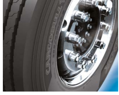
Schmitz Cargobull premium tyres: complete tyre management for optimising mileage (km), maintenance and costs. Perfectly designed to meet the needs of the fleet.