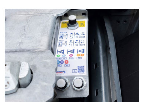
Control for the pneumatic rear extension with optional manual locking.