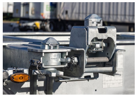
With 2 x 20' loads, the height-adjustable KLAPP LOCK takes over the securing of the front container.