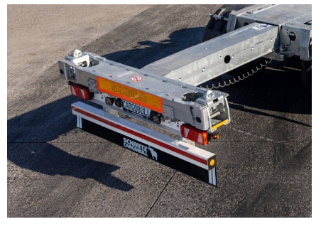
New: The damped rear extension moves pneumatically to the selected locking position and brakes gently.