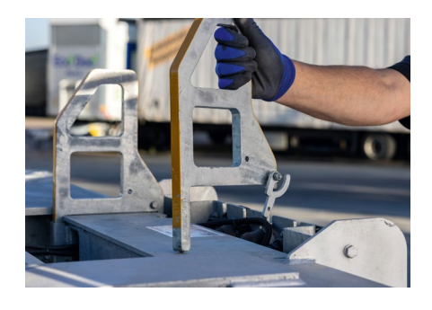
Easily replaceable container guides for containers on the front beam.