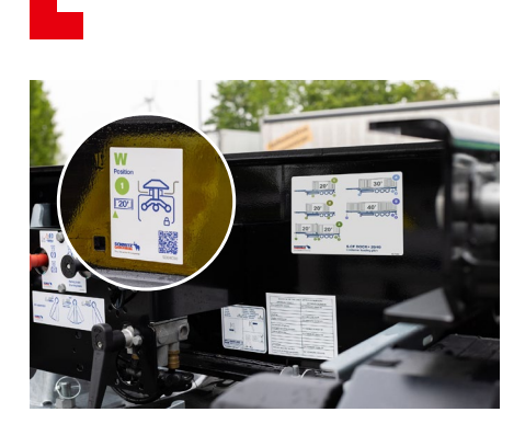
New operating concept with loading plan and clear function and warning notices on locks and extensions.