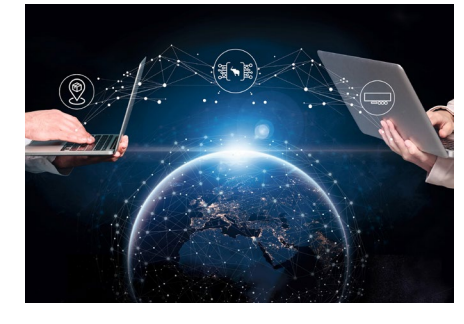
Selective data exchange

With the TrailerConnect® Data Management Center, you create a link to partners and sub-forwarders and gain a centralised view of your transport network.