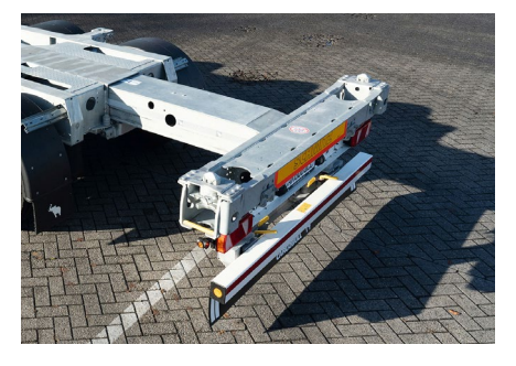
New: The rear extension moves pneumatically to the selected locking position and brakes gently.