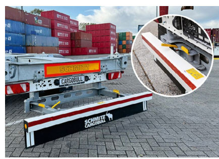
New design: The extendable underride guard for 45' containers is more ergonomic and easier and safer to handle with no loose parts to get lost.