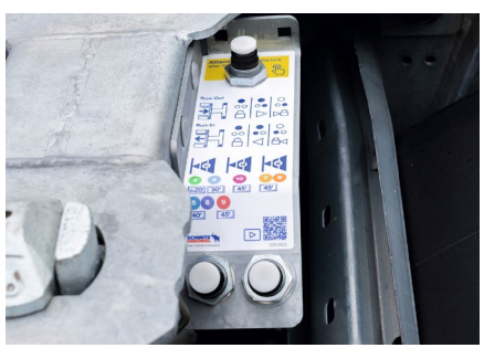
Control for the pneumatic rear extension with manual locking.