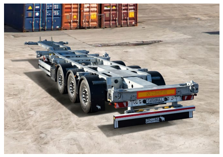
Maximum flexibility and security

The S.CF ALLROUND container chassis is prepared for containers from 20' to 45' with and without tunnel. Front and rear extensions allow easy adjustment to the respective container sizes and offer maximum flexibility.