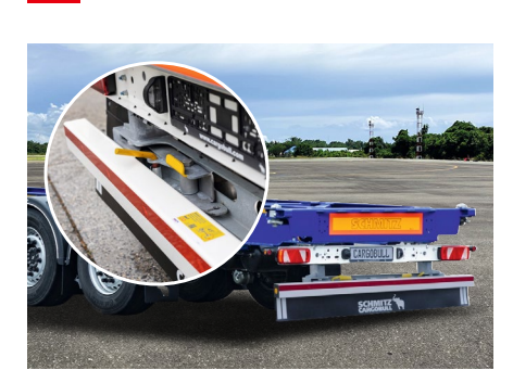
New design: Extendable underride guard for 45' containers is easier and safer to handle with no easy to lose, loose parts.