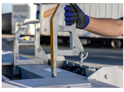
Easily replaceable container guides for containers on the front beam.