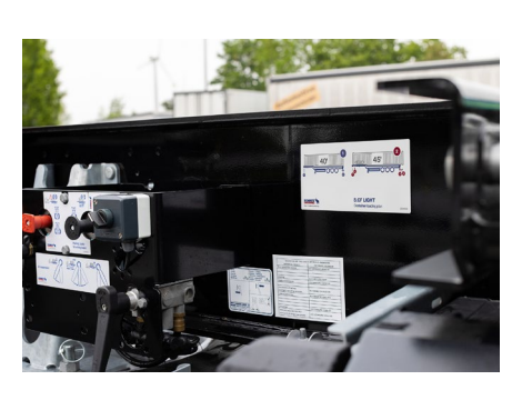
New operating concept with loading plan and clear function and warning notices on locks and extensions.