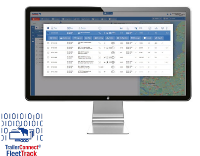
Real-time fleet visualisation with TrailerConnect® FleetTrack

The consolidated visualisation of all telematics data creates real transparency along the supply chain. The controlled exchange of data with third parties ensures greater security and efficiency in your day-to-day transport operations.