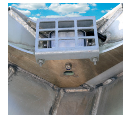
Interior lighting of the aluminium volume body enables the cleaning or handling of palletised freight, even with the tarpaulin closed.