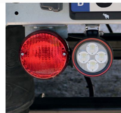
Reversing light using LEDs, offering a long service life, fitted to the rear of the chassis.