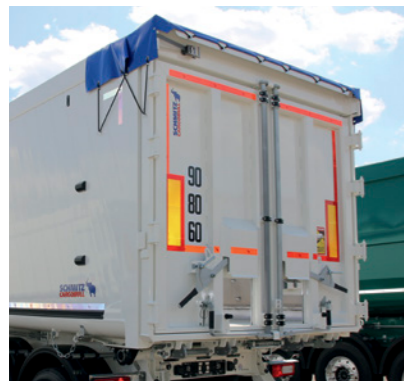
Combi-door with a pendulum frame, two door wings and two grain sliders.