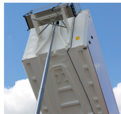
Partially recessed chassis neck area in the body floor assembly for a lower body loading height and a reduced overall height.