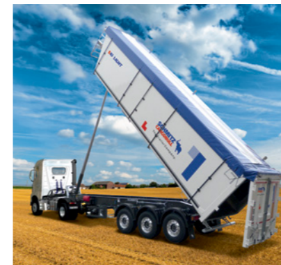
Arc-shaped roller tarpaulin for easier handling. The tarpaulin is closed from the ground using the long middle tensioning belt.