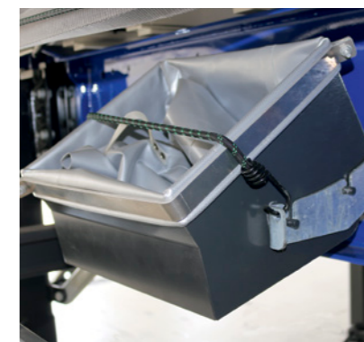
Grain hopper for grain slider with practical parking position on the chassis or protected in the stowage box.