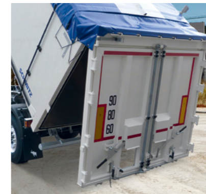
Emptying with the tarpaulin closed using the pendulum function of the combi-door saves time when unloading.