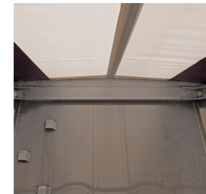
The arc-shaped design of the roller tarpaulin with a stabilising central tube prevents water from collecting.