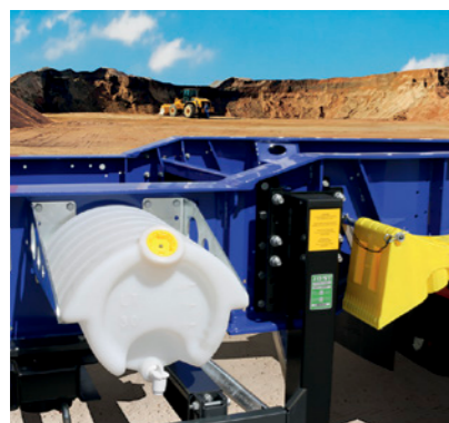
The offset in the neck area of the chassis (step-frame) allows for a reduced loading height.