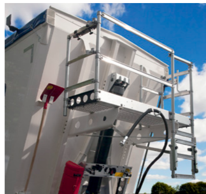
Height-adjustable working platform with anti-slip floor, trough boarding aid and park position for hydraulic hose.