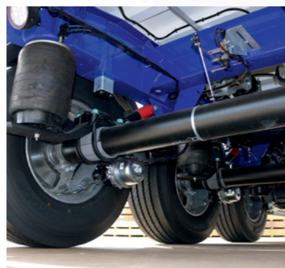
Weight-optimised ROTOS-running gear with low construction height, 430 mm diameter disc brake and air suspension.