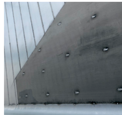
Additional wear plates in the rear increase the service life of the body.