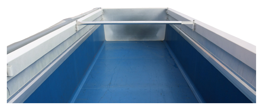
funding from the Federal Office for Goods Transport within the German market. gw gw

smooth and clean outflow of the bulk material also reduces unloading times and the need for cleaning. The plastic cladding comes in two side heights (300mm and 900mm) and is clearly identifiable by its blue finish. The body cladding consists of 12.5mm (S.KI 7.2 and 8.2) or 10mm (S.KI 9.6 and 10.5) thick plastic sheets. The plastic cladding is eligible for De Minimis