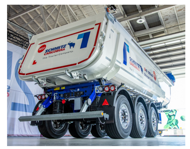
The new bodies and frames for the S.KI and the M.KI will go into production in the first quarter of 2023, and offer up to 280kg of additional payload.

Depending on the application, the required trough volume and the degree of stress, four different trailer system lengths are available in a Standard version, a Light version for high payloads, or a Heavy-Duty version for heavy use. The