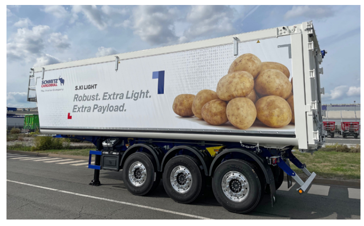
The S.KI LIGHT AK impresses with its stability during tipping. driving control and good road holding when cornering.

The S.KI LIGHT AK is now available in three system lengths. The tapered frame design provides for low loading heights, floor heights and overall heights in all lengths, while the fifth wheel height remains unchanged.