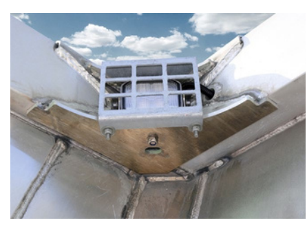
Interior lighting for aluminium volume skips enables cleaning or handling with palletised freight even when the top is closed and ensures better illumination during night-time operation.