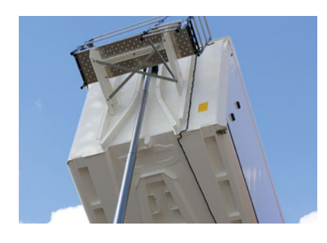
Partially lowered chassis neck area in the floor assembly of the body for a lower body loading height and a lower overall height.