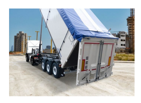
The curved roller curtain is easy to handle and can be closed from the ground using the long centre tensioning strap. Emptying with the curtain closed using the swing function of the combi door saves time. The arched shape with stabilising central tube also prevents water from collecting

Quality is the top priority for all components that we install in the S.KI LIGHT tipper semitrailer. Our aim is to ensure economical use over a long service life.