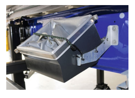
Grain outlet hopper f or grain pusher with practical parking position on the chassis or protected in the storage box.