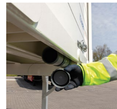
Document tube* for accompanying documents mounted on the underside of the rear.