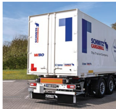
Double folding door with robust, external espagnolette locks. When open, the doors are secured with a chain.