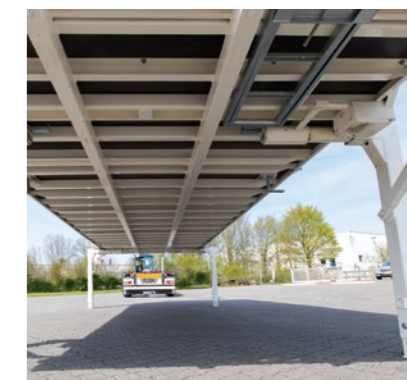
Stable and robust base for high loads and frequent changes.