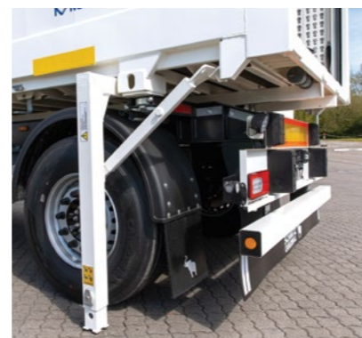
Four support legs with diagonal securing according to DIN EN 284 (as standard version with fixed fifth wheel height of 1,320 mm). Four receptacles for securing with twist locks according to coding profile C30.