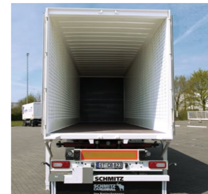
Opened double wing door with an opening angle of 270°. Close-fitting to the side wall for good manoeuvrability.