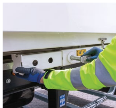
Adjusting the telescopic support leg* for the semi-mounting heights of 1,120 mm, 1,220 mm and 1,320 mm.