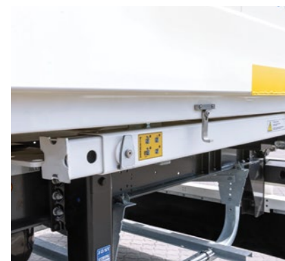
Support leg 90° in transport position with safety catch.