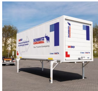
Detached Swap Body W.BO in robust steel construction with rail-compatible roller shutter*. The swap body is ideal for use in CEP transport, encounter and freight transport.