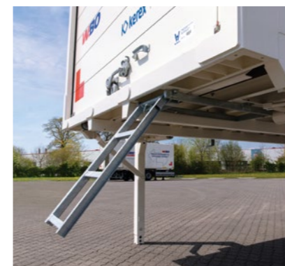
Galvanised steel folding ladder for access to the load compartment.