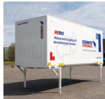
Smooth front and side walls for individual labelling. For freight rail transport, the W.BO interchangeable boxes are equipped with gripping edges.