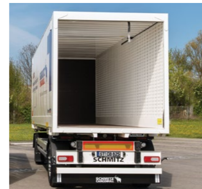
Open roller shutter* in interchangeable case for fast loading cycles, quick access at the ramp and in confined spaces.