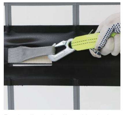
Easy handling: belts with carabiner hooks are suspended in the tarpaulin loops.

Rear load securing for partial loads thanks to stitched-on tarpaulin loops, either for tensioning belts or safety tarpaulins. Arranged in three rows above each other, the loops have a securing force of up to 7,500 daN with partial loads (2,500 daN per row).