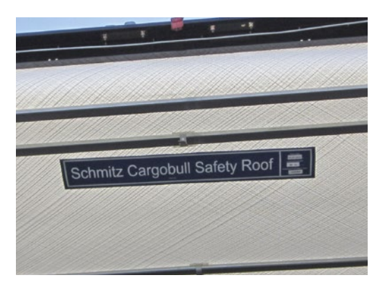
The Schmitz Cargobull safety roof – reinforced by integrated plastic fibres – increases the structural rigidity.