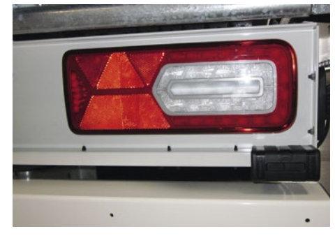
LED rear lights with striking flashing function, energy-saving and less likely to fail. (optional)