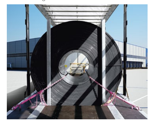
The correct way to transport heavy coils: Combined load security for heavy strip steel rolls.