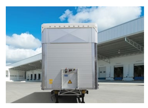
Steel corner stanchions on the bulkhead and rear door increase structural rigidity.