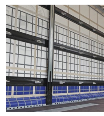
Shorter loading and unlocking times: Body without support laths and lath brackets