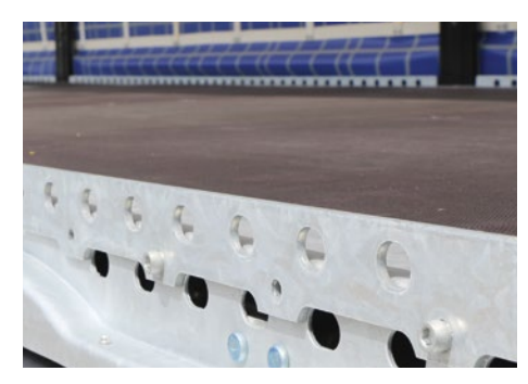
Lashing holes along the entire length of the outer frame for flexible load securing. With optional pallet stop rails.