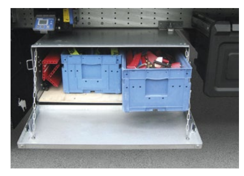
Steel box on the chassis for stowing the load securing equipment.