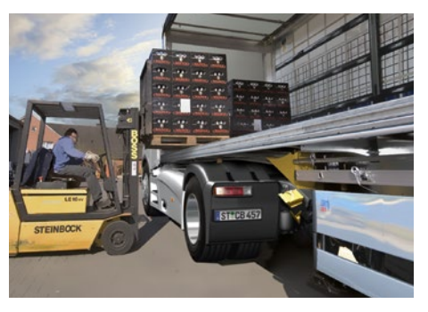
Efficiency for the beverage industry: Certified load security for beverage transportation.