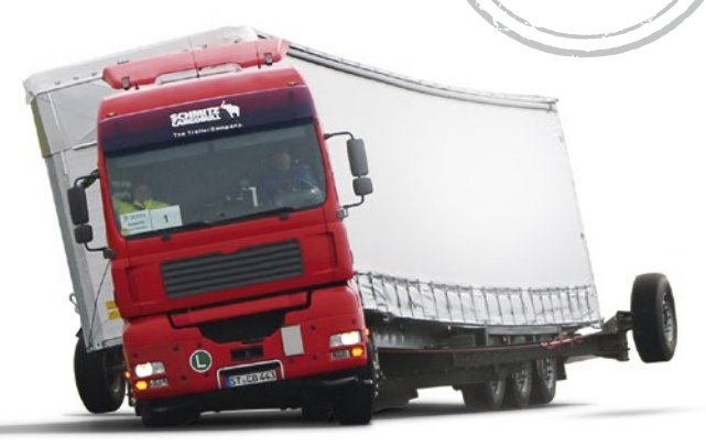
Certified according to DIN EN 12642 Code XL and for beverage transport. Also available with DL Directive 9.5 compliance.

Structural strength: DIN EN 12642 Code XL