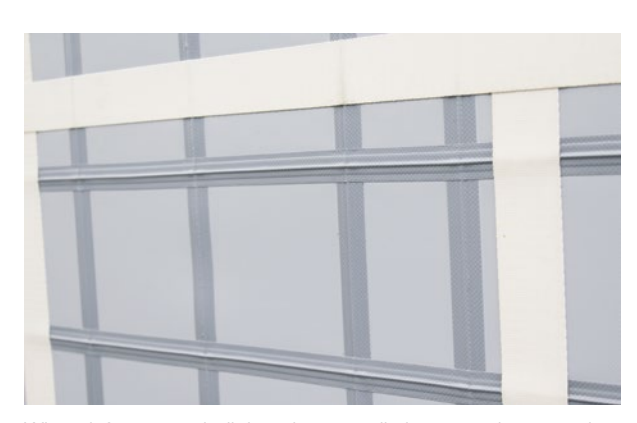
Wire reinforcement built into the tarpaulin increases its strength and improves anti-theft protection.