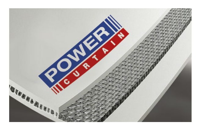
Aramid fibres in the tarpaulin increase the load capacity – the taut curtain stabilises the body and secures freight that is flush with the sides.