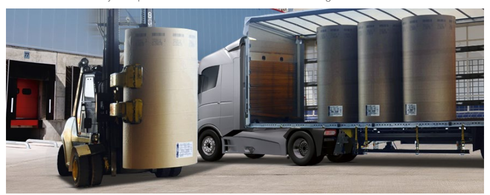
S.CS PAPER X-LIGHT: Tested and approved for paper roll transportation.