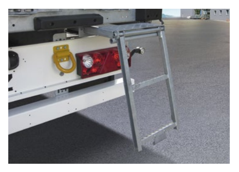
Sturdy ladder with large step surface.