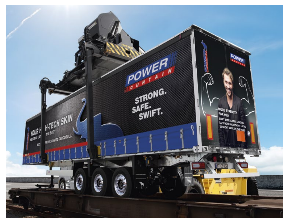
Combined rail and ferry transport: Combined units for easier scheduling

Further areas of application include transporting heavy coils, tight rolls of paper and freight for the chemicals industry. It also meets the additional requirements for railway loading and ferry transportation with ease.