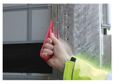
Robust handle on the rear frame for easier entry and exit.