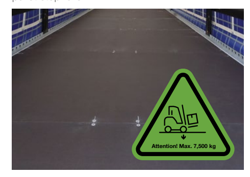
Glued floor: greater stacker axle load of 7.5 tonnes, sealed load area to protect against moisture.