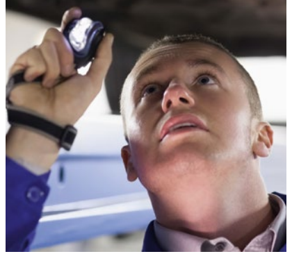
Full Service trailer and tyres: highest-quality service, improved value retention, reliable cost planning and reduced administrative overheads.