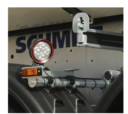
LED light package: LED tail lights plus four reversing lights at the rear and at both sides above the running gear.