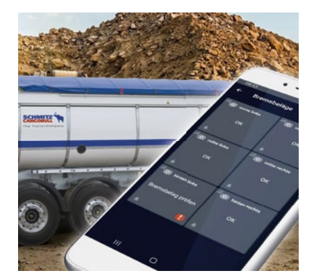
Brake pad wear indicator+: The new BBVA+ specifically identifies the tyre with a worn brake pad.