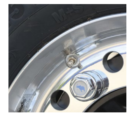
Tyre pressure monitoring system: decreases tyre wear, lowers fuel costs and reduces the risk of breakdown.