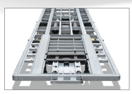
Roller-profiled MODULOS chassis: Corrosion-resistant and repair-friendly design, thanks to bolted, hot galvanised technology.

Higher trailer load through 8,130 mm wheelbase