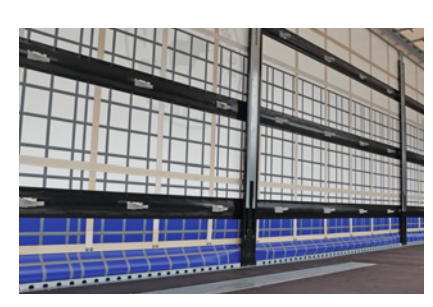
POWER CURTAIN*: Body free from support laths for shorter loading and unloading times and greater operating safety.