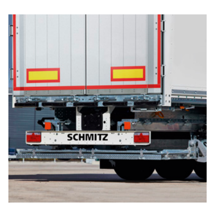
Under-ride tail lift* for loading and unloading without ramp.