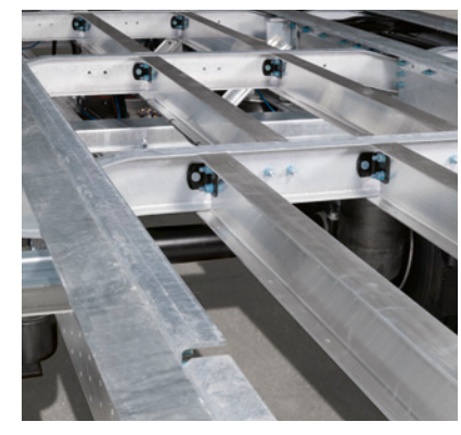
Rolled MODULOS chassis: Corrosionresistant and easy-to-repair thanks to the bolted and hot-dip galvanised technology.