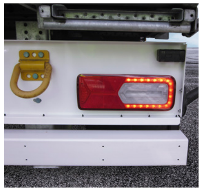
Combined transport: Ferry Lashings* for shortsea transport. For more safety - underride protection according to ECE regulation 58.03.