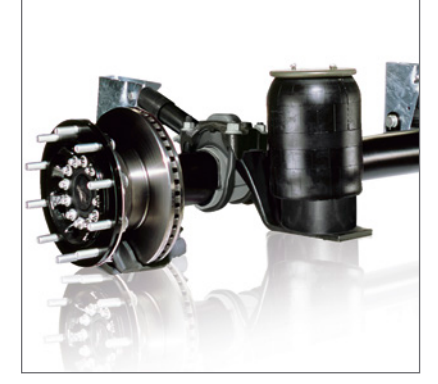
ROTOS axle with reliable bracking effectivity due to 21" discs with intelligent air cooling at the axle head.