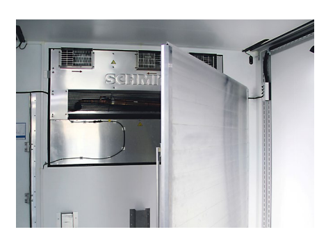
Proven technology: The refrigeration circuit is identical to conventional cooling units. The handling remains the same and requires no further training.