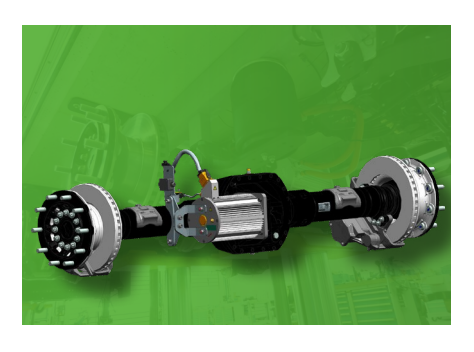
The e-axle recharges the high-voltage battery while travelling by regenerative and recuperative means, which extends the battery life and increases the availability of the all-electric refrigeration unit.