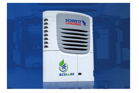
S.CU ep85 electric cooling unit with up to 15,800 watts of cooling capacity and 10,500 watts of heating capacity. The charging and battery management system ensures a constant and efficient energy supply.

The recuperating e-axle generates energy and thus extends the operating time of the cooling unit. The battery charge management system ensures that the battery is charged depending on the selected mode in order to keep the temperature in the semitrailer box constant at the set point.