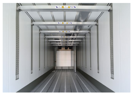
Reliable load securing: The S.KOe COOL offers numerous equipment options customised to your transport needs. An intelligent system of load securing rails make loading and unloading safe and easy.