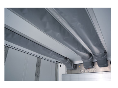
Efficient air flow: With three air ducts and a collision-resistant hood, the tempered air is evenly distributed throughout the body, ensuring low energy consumption.